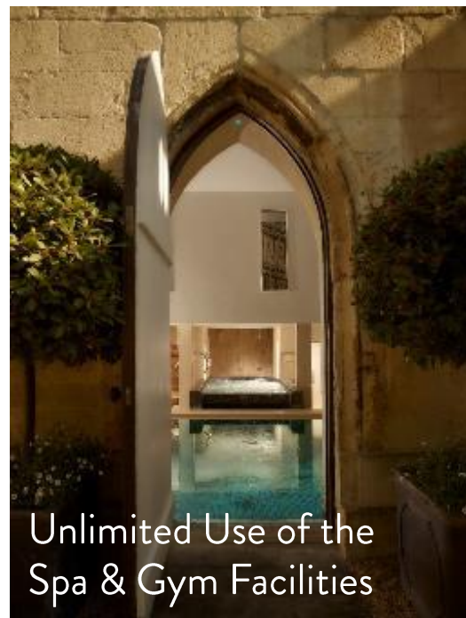
Unlimited Use of the Spa & Gym Facilities