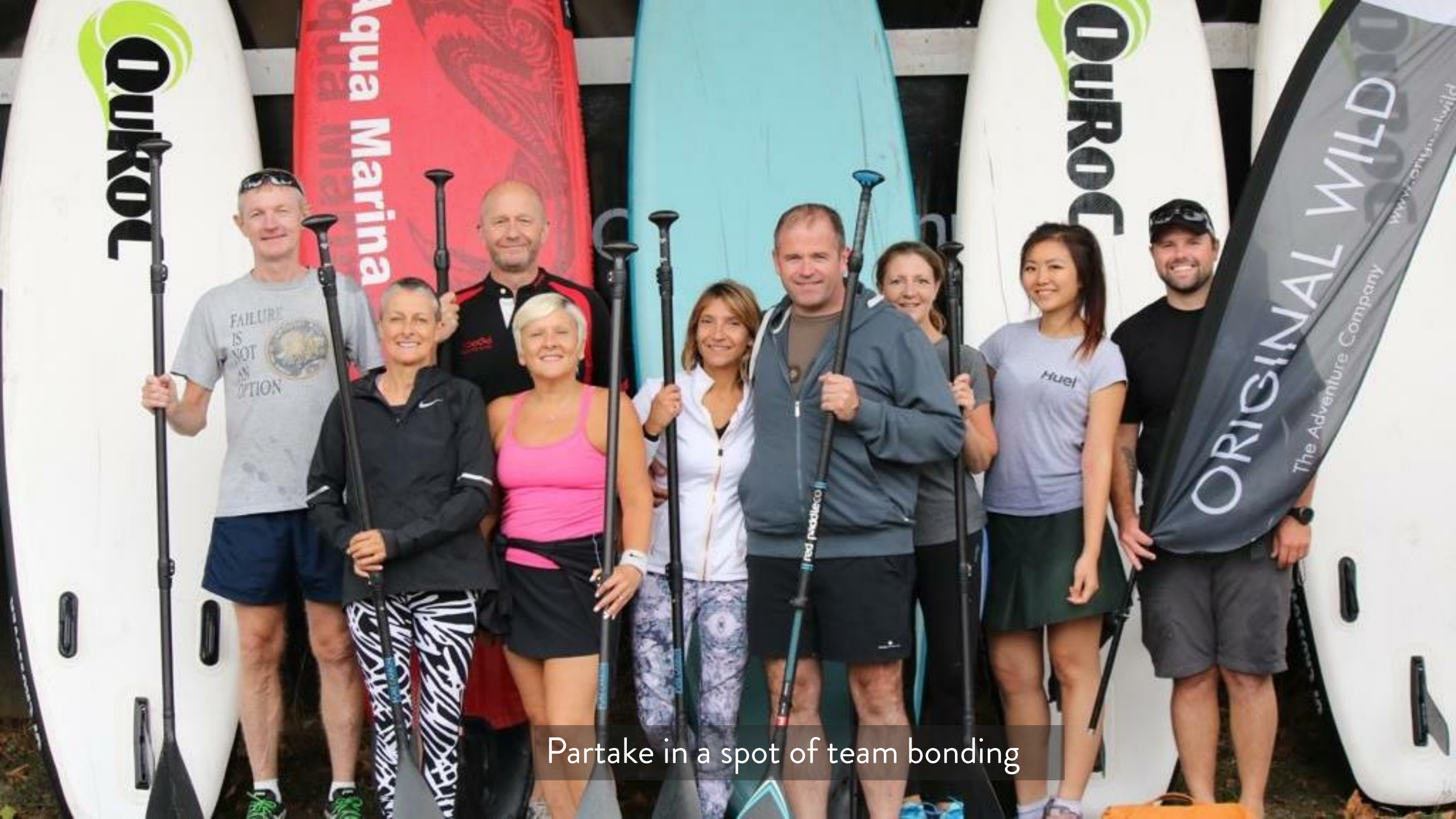
Partake in a spot of team bonding