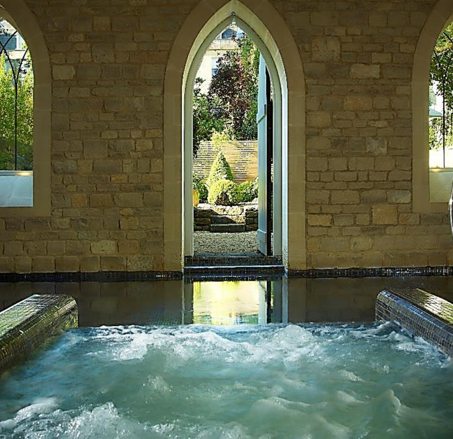
Unwind in our Spa & Bath House