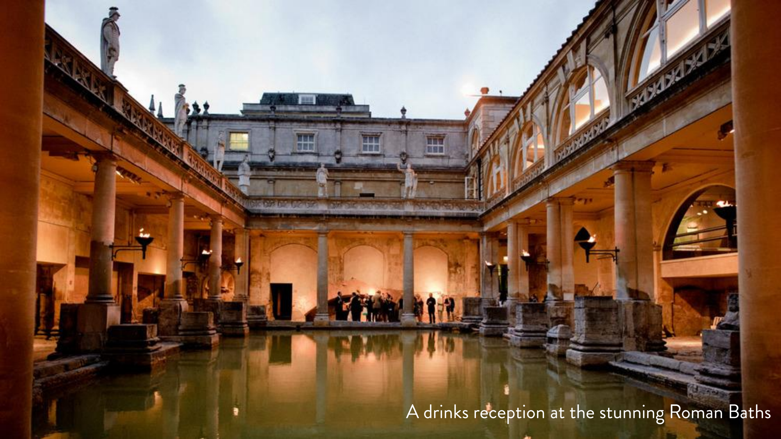
A drinks reception at the stunning Roman Baths