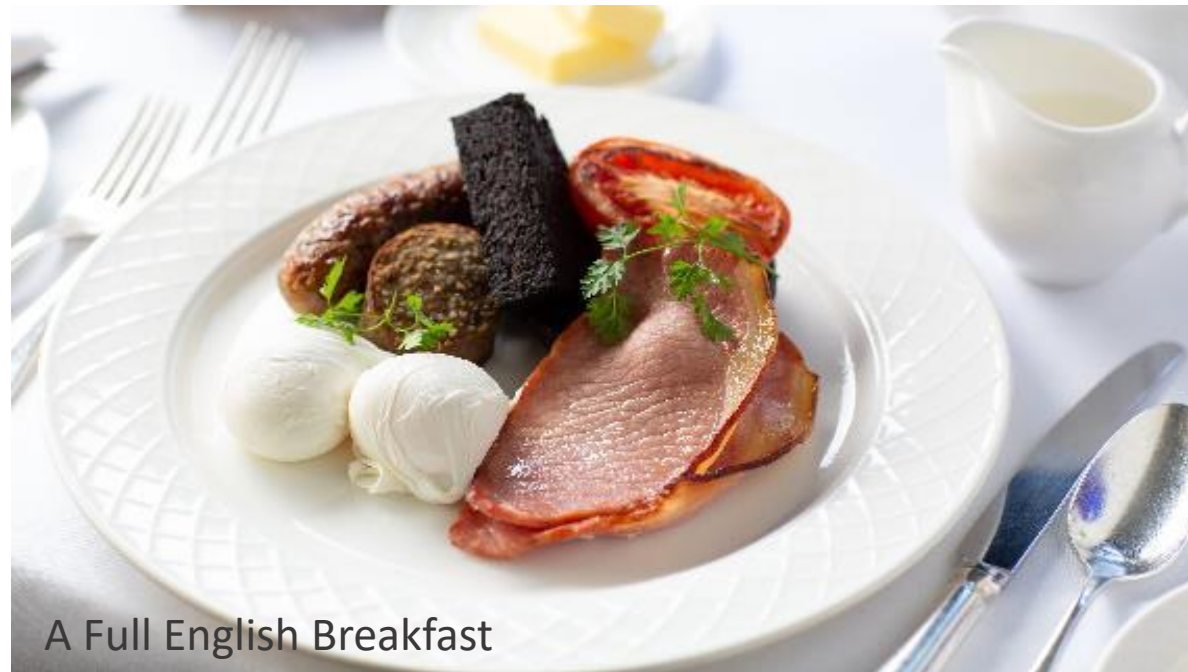
A Full English Breakfast